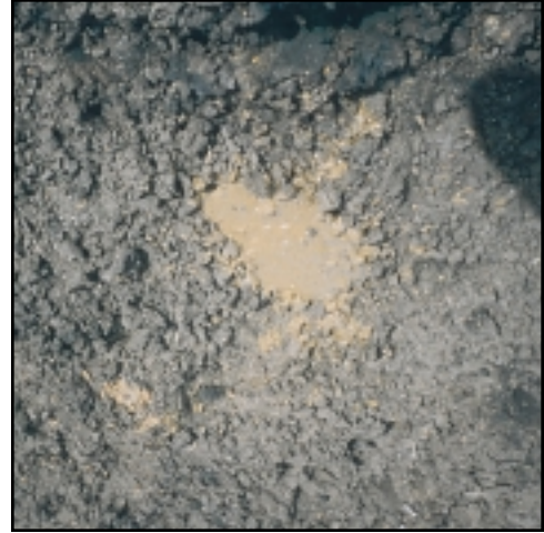
Border Line - Subacute Acidosis Re-Evaluate Feeding Levels