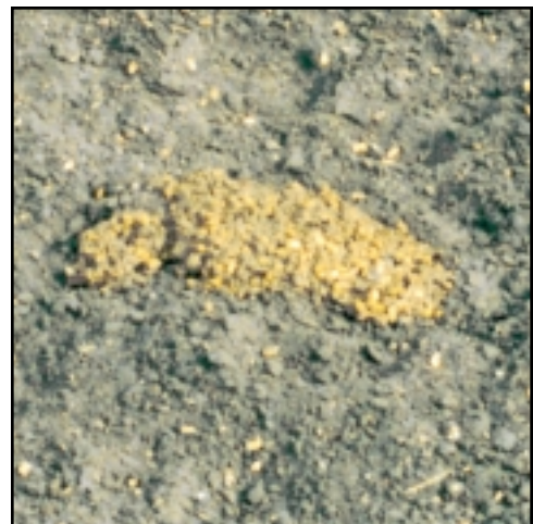
Reduced Rate of Passage Monitor to Avoid Overfeeding