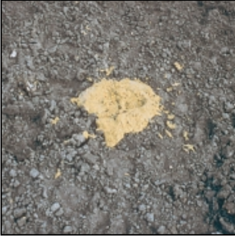
Ideal Dropping Optimizing Cattle Performance