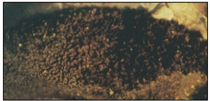
Affects of Acidosis on Rumen